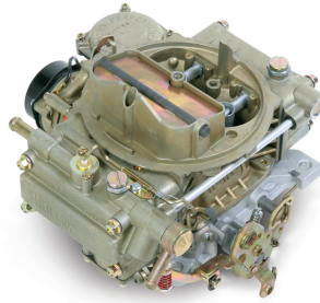
Model 4160 Square Flange