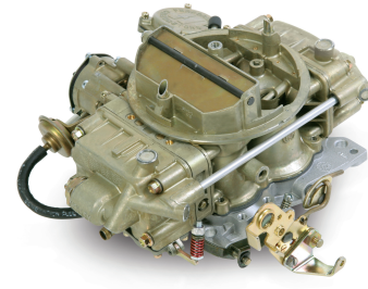
Model 4175 Spread Bore